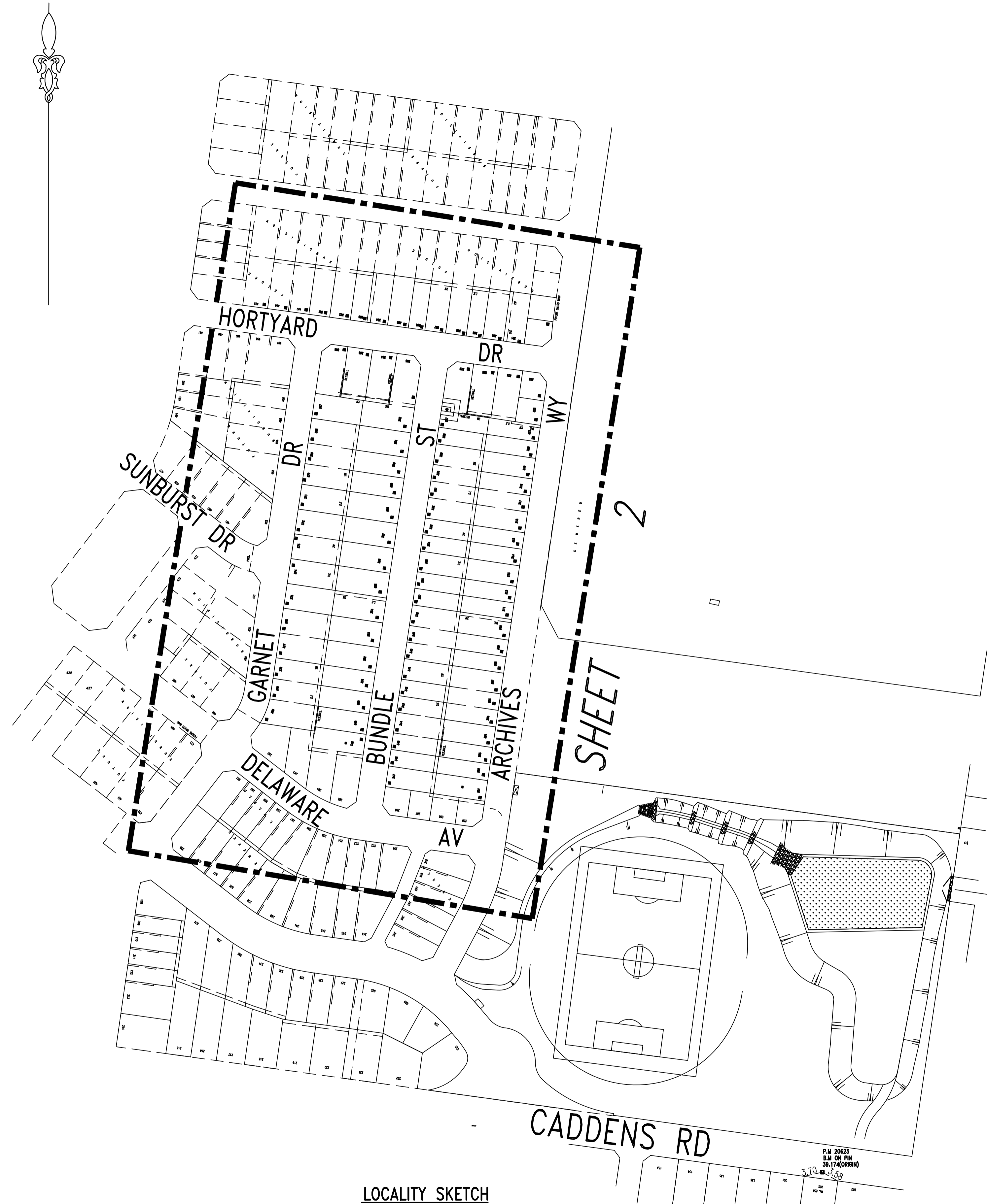
LOCALITY SKETCH (NOT TO SCALE)